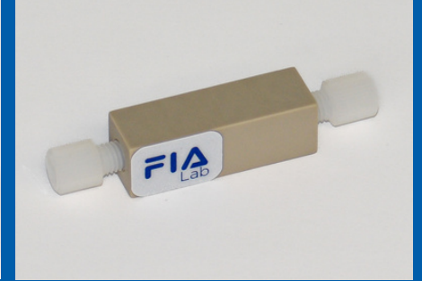
ProA Purification Column

Eliminate plastic pipette tips and well plates from analysis.