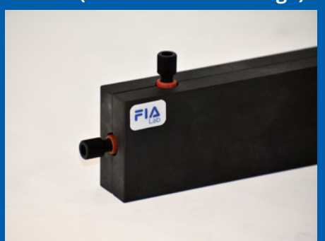
SIAlock and Hub